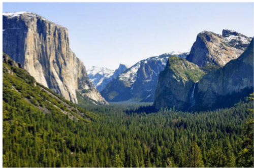
Figure 1-1: Yosemite Valley from Tunnel View

Yosemite National Park is a United States National Park spanning eastern portions of Tuolumne, Mariposa and Madera counties in the central eastern portion of California, United States.