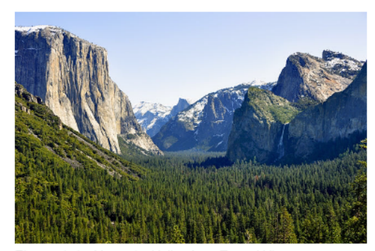
Figure 1-1: Yosemite Valley from Tunnel View

Yosemite National Park is a United States National Park spanning eastern portions of Tuolumne, Mariposa and Madera counties in the central eastern portion of California, United States.